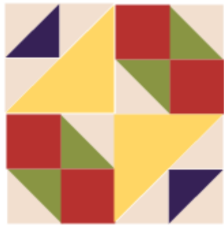
Sew rows together